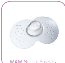
MAM Nipple Shields