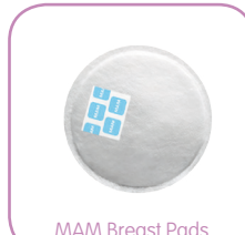
MAM Breast Pads