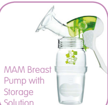
MAM Breast Pump with Storage Solution